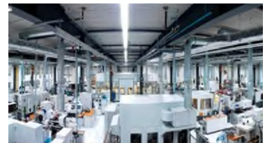
View of Wittenstein SE’s “Future Urban Production” site in Fellbach