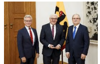
The inventor team nominated for the Deutscher Zukunftspreis 2018 with German President Frank-Walter Steinmeier