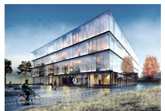
The Software Factory