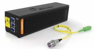
IDS3010 optical sensor for nano-measurements