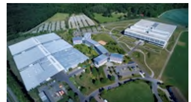
WITTENSTEIN SE headquarters in Igersheim-Harthausen