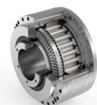
The miniaturized Galaxie® opens up new options in surgical robotics