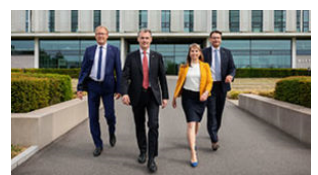
The Management Board