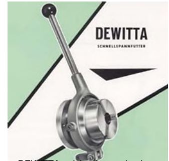
DEWITTA quick-release chuck

The unstoppable growth of WITTENSTEIN's alpha getriebebau subsidiary rendered further expansion inevitable. The complete assembly side was