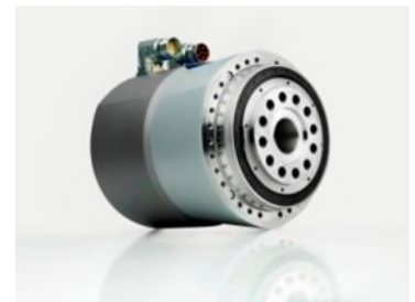
The WITTENSTEIN Galaxie® Drive System: a world first and winner of the HERMES AWARD 2015