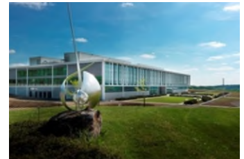
The WITTENSTEIN Innovation Factory is officially opened in May 2014 in Igersheim-Harthausen