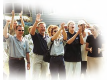
Now and then: the company's most important capital are the people who work for it