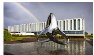
Logo sculpture in front of the Innovation Factory