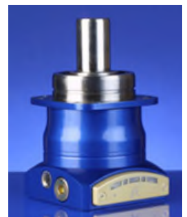
A vision of the nineties, realized in 2001: the intelligent alpha ® IQ gearhead