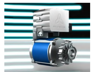
Vision for the future: a highly compact electric drive system