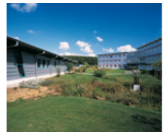
WITTENSTEIN SE World Garden in Igersheim-Harthausen