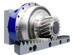
TPM* servo actuator with rack and pinion