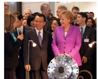
2009: Chancellor Merkel visits the WITTENSTEIN booth at the Hannover Messe